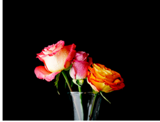
EPSON 9900 PRINT

Place your order, be sure to mention Discount Code: 1231 , and we'll deduct 15% from all your printing. (This promotion cannot be combined with any other discounts. Sorry, mounting and other services are not included in this holiday special.)